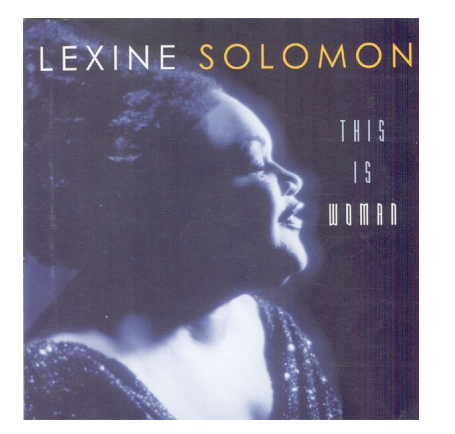
Figure 6: Lexine Solomon - This is Woman CD front cover (2002)