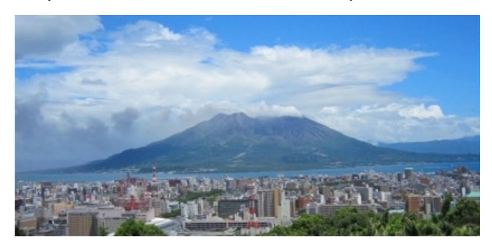
Figure 1 - Sakurajima viewed from Kagoshima City.

Sakurajima is an icon of Kagoshima City and Kagoshima Prefecture, especially because of its commanding and active volcano. Its status is strengthened not only by the fact that it is visually conspicuous in Kagoshima Bay and directly opposite the urban waterfront of Kagoshima City (the capital of Kagoshima Prefecture and fourth largest city on Kyūshū), but also because it stands out as a natural attraction for visitors and locals alike. Sakurajima's volcano is the cynosure of all eyes and has had a major impact on the former island and region, and as such a number of volcano-related and other attractions have been developed to welcome visitors and contribute to the local economy.