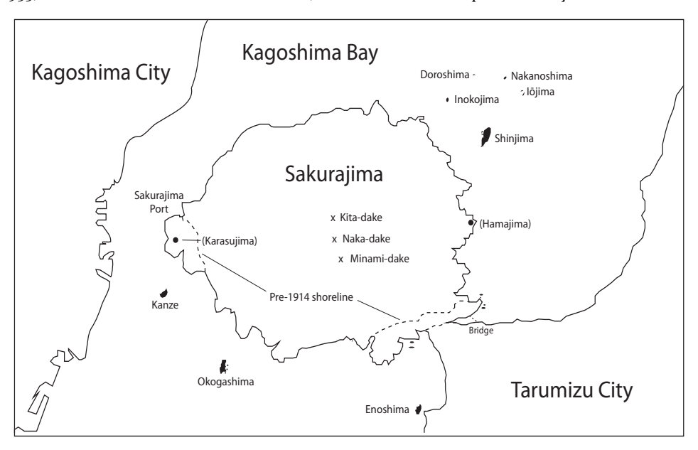
Figure 4 - Sakurajima and surrounding region. (After http://english.freemap.jp - accessed March 1st 2014, illustration by Henry Johnson, 2014.)

Geologically, Sakurajima is within the Aira caldera, along with the northern part of Kagoshima Bay, and was formed about 26,000 years ago from a stratovolcano (Geological Survey of Japan, 2014; Omori, 1914; Sagala, 2009; Sakurajima Taishō Funka, 100-shūnen Jigyō Jikkō Iinkai, 2014; Yokoyama, 1997). The andesitic volcano has had several major eruptions over the centuries (Table 2). The summit of the volcano divides into three peaks: On-take (also called Kita-dake: northern peak; 1117 m), Naka-dake (central peak; 1060 m) and Minami-dake (southern peak; 1040 m), the latter of which is currently active. In recent history, the most significant eruption of the volcano on Sakurajima occurred on 11 January 1914, after being dormant for about one century (Sagala, 2009: 54), when, over several days, a massive volcanic flow filled the Seto Straight (Seto Kaikyō) and joined the island to the Ōsumi Peninsula. The lava flow also joined several outlying islands to Sakurajima. Since 1955, the volcano has become more active, and continues to erupt to this day.