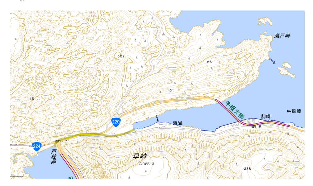
Figure 5. Map of lava link and bridge between Sakurajima and the Ōsumi Peninsula. (Courtesy of the Geospatial Information Authority of Japan, http://www.gsi.go.jp - accessed 1 March 2014).

Name and Shape. For Sakurajima, and similar to some of the places mentioned above, the former island has a word as part of its name that still means 'island': the suffix iima/shima (island). As a place name, the word 'Sakurajima' could be changed as a way of indicating the location's new physical existence, just as villages become towns, and towns become cities (in Japanese, each has an appropriate suffix), although, for the reasons outlined later on, this is unlikely to happen for Sakurajima. One of these reasons might be that as a location its name is fixed as a place name and there is no wish to change it, regardless of the fact that 'Cherry Island' is no longer an island. Another reason might be that Sakuraiima still maintains many characteristics that are island-like (as discussed below). Another reason is that there are many other locations called shima in Japan that refer not only to islands, but also to places that are not islands. For example, there are places such as Fukushima and Hiroshima on Japan's largest island of Honshū, both of which are names of cities and prefectures. Closer to Sakurajima, there are several other 'island' names used for places that are not islands. For instance, the very prefecture in which Sakurajima is located is called Kagoshima-ken (Fawn Island Prefecture); the name for the largest city in the prefecture is Kagoshima-shi; and, as mentioned earlier, a nearby city is called Kirishima-shi (Fog Island City).