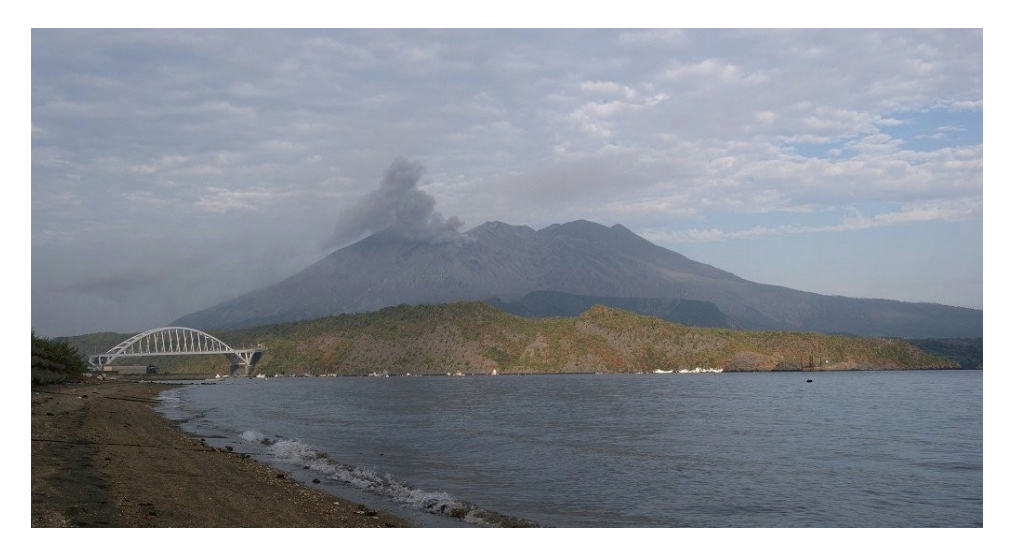
Figure 6. Ushine Ōhashi (bridge) between Sakurajima and the Ōsumi Peninsula.

consolidate their local identity by sharing waiting times for the ferry and interacting over the short journey. In this setting, the ferry service helps create a communal context for locals, as another interpretation of islandness, whereas traveling by car over the bridge is more individual and a much longer journey. Also, in terms of cost, the ferry service is especially expensive if taking a vehicle, so most commuters are foot passengers or take a bicycle.