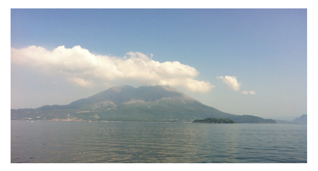
Figure 1 - Sakurajima (with Okogashima in the foreground).

Koshikijima and Chiringashima are islands surrounded by sea; Sakurajima is a former island and a part of Kagoshima City; and Kirishima is the name of a mountain range that includes several peaks (Karakunidake, Shinmoedake, Nakadake, and Takachiho no Mine), which look like islands rising from the land. Thus, when referring to Kagoshima as a tourist destination, the notion of islandness is embodied within such marketing. These shima (islands) offer some slightly different interpretations of the notion of 'island' in the Japanese context, each of which allows for a broader definition of the term. In particular, Sakurajima stands out as a former island, a place that maintains a short ferry service and has a road bridge (they are on opposite sides of the 'island'), and a landmass that maintains a distinct sense of of islandness. It is this location that isthe focus of this paper, one that offers a site where the notion of 'island' is manifest as a result of social, cultural and environmental influences and sensibilities.