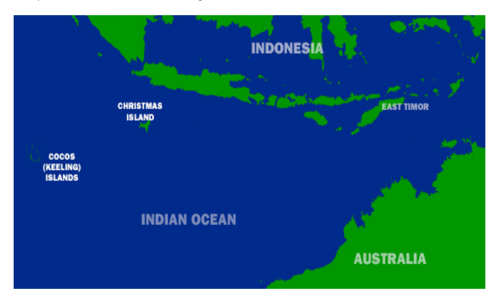
Figure 1 – Christmas Island and the Cocos Islands and their location in the north east Indian Ocean

international criticism for not appropriately exercising its sovereignty over its citizens and ensuring their rights to self-determination and access to basic human rights including education. It was against this contextual background that in 1984 the Cocos Malay community were offered an act of self-determination witnessed by the United Nations with three options: a) full integration with Australia; b) independence; or c) free association (ie maintaining the status quo under the Clunies-Ross regime) (Bunce, 1988). The vote resulted in full integration with Australia.