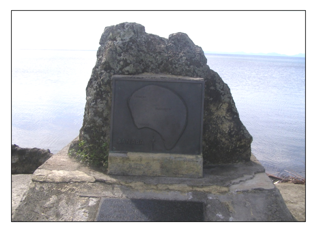
Figure 2: Marker on Rabi Island, showing the spot where the Banabans first arrived in 1945