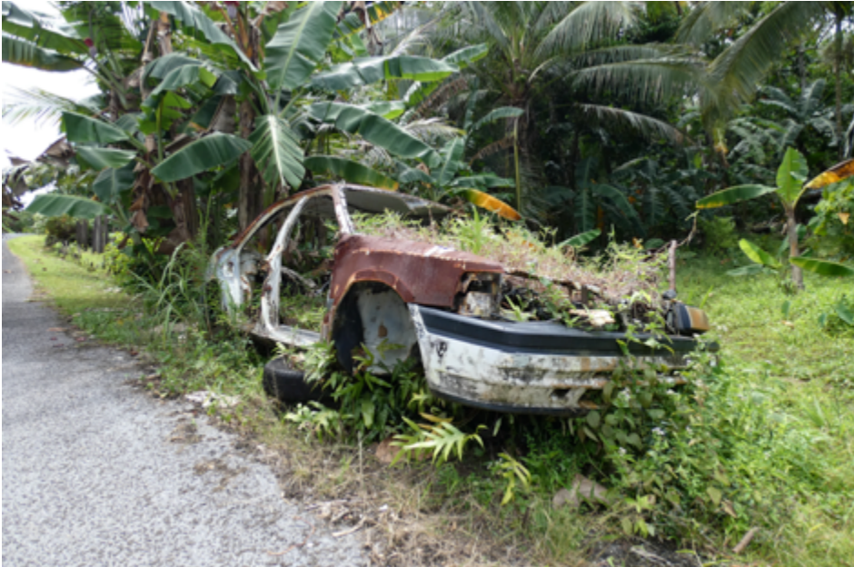
Figure 2 - A decaying car by the roadside strikes a discordant note in the tropical landscape of Pohnpei.

to pay for repairs, with many cars left at repair shops indefinitely. The need for repair is considered in part to be driven by poor road conditions causing vehicular damage (Ur, 2015), and is compounded by the fact that so many of the cars in Pohnpei (and across the FSM) are purchased as cheaper, imported used cars, resulting in the need for repair sooner than may otherwise be required with new vehicles.