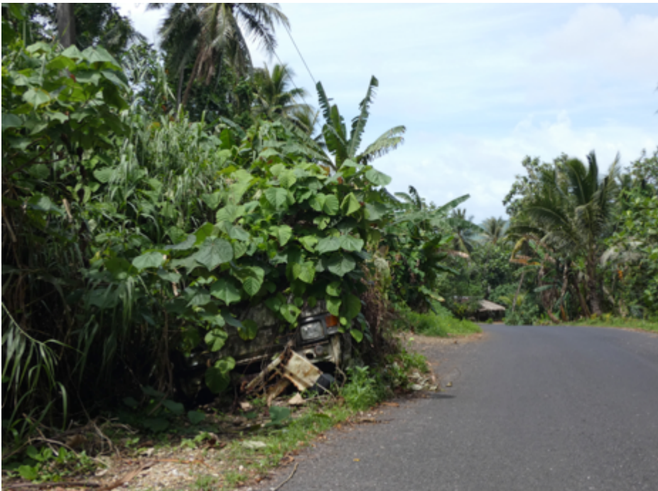
Figure 6 - Invasive plants are quick to engulf abandoned vehicles, like this small van.

Beyond the issue of waste, these cars present a number of environmental problems. Importantly, abandoned vehicles are a public health problem. They are a physical hazard, particularly to children, who play in or on them. The vehicles also pose a pollution risk as remaining oil, brake fluids and other chemicals that have not been removed can leak into the surrounding environment as they rust and decay. There are concerns that these vehicles become habitats for vermin and insect pests, particularly mosquitoes (JICA, 2013), an issue that is recognised in other places where abandoned vehicles are prevalent (Lynch, 2019). Disrupting the natural environment as they do also provides an opportunity for invasive plants to gain a foothold, as can be seen in Figure 6, where a small truck has been subsumed by the ‘mile-a-minute’ vine Merremia peltata .