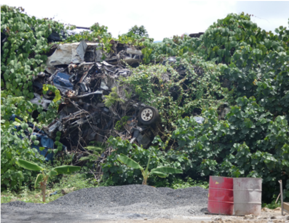
Figure 5 - A wall of scrapped vehicles under a blanket of vegetation parallels the causeway that carries travellers between Pohnpei International Airport and the main island.

occurred, as any who pass through Pohnpei International Airport will be able to see; Figure 5 shows a wall of cars lying parallel to the causeway that joins the airport to the main island. That this not insignificant collection of vehicles is being so entirely subsumed by vegetation highlights the fact that they have been there for some time. This re-enforces the need for a solution that goes beyond simple collection. The question then becomes what to do with these vehicles? Disposal of solid waste is a perennial issue for many islands, and in the case of Pohnpei there aren't great enough quantities of large solid waste items such as old appliances, recyclables and vehicles, for full-scale waste management facilities to be an economically viable option on the island itself. The alternative is the transportation of waste for processing elsewhere, but this is expensive and is limited by a lack of suitable recipients. Government agencies are working on developing agreements with overseas partners to export different types of waste and recyclables, with aluminium cans collected and shipped to Korea for recycling. In the past some scrap metal from vehicles has been exported to China (EPA, 2014), but hopes for an ongoing partnership between the FSM and China to deal with junk vehicles were dashed when the latter introduced a ban on the import of scrap metal and crushed car parts in 2018 (General Administration of Customs, PRC, 2018).