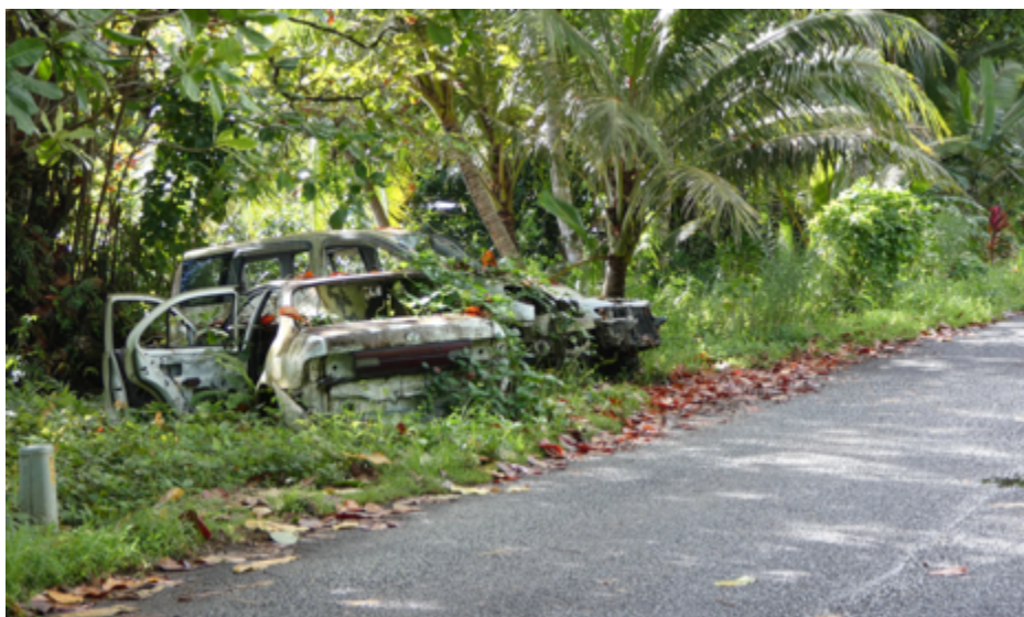
Figure 3 - An influx of used cars brings with them the potential for sub-standard emission levels.