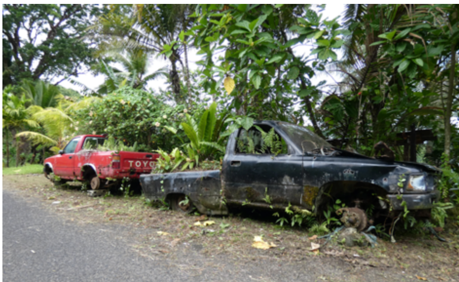
Figure 4. Like these trucks, the majority of cars imported to the FSM originate in Japan.

The abandoned cars of Pohnpei are just one facet of the broader waste disposal conundrum that many government and non-government personnel consider to be the single greatest environmental problem facing the island. Some collection of end-of-life vehicles has