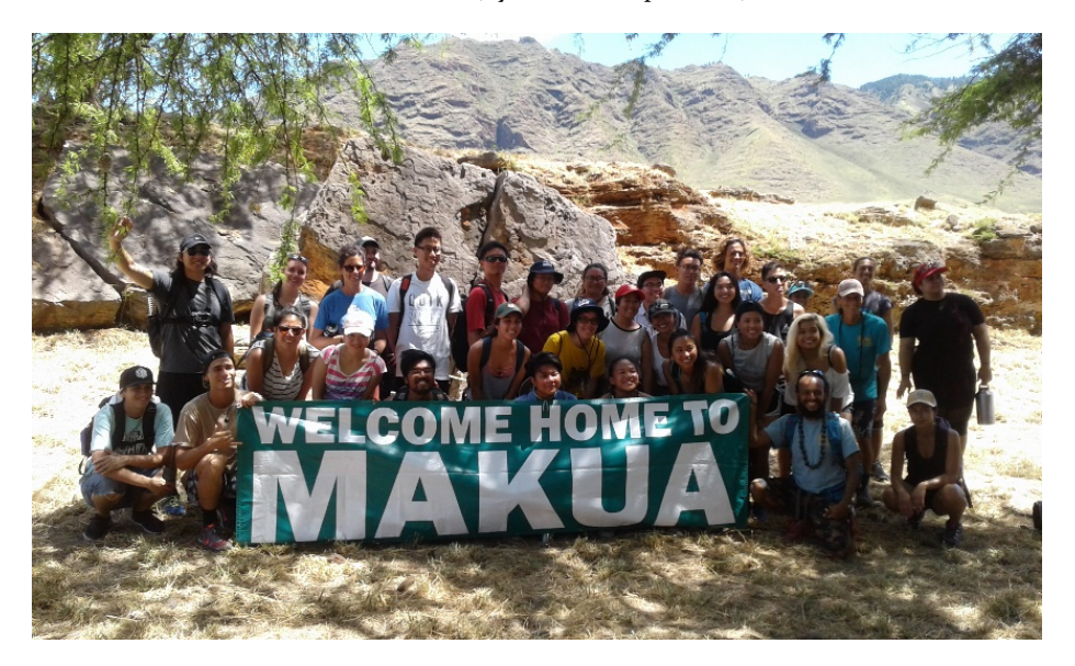
Figure 3 - Mālama Mākua, Cultural Access, February 2018

Don't call what we are doing performance. We are practicing our culture. You can call it culture in action. When we dance, we are doing a re-enactment of our ancestors. We become them. (Lynette Cruz, p.c, 2018)