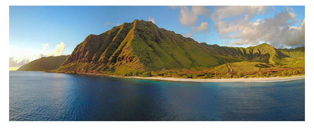
Figure 2 - Mākua, Oahu