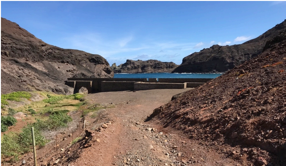
Figure 4 - East India Company fortifications at Sandy Bay.

Islands. These islands were the sole sources of nutmeg and mace until the nutmeg tree was transplanted elsewhere in the mid-19th Century. Exploitation and control of the spice trade saw rivalry between the Portuguese, Spanish and later the Dutch, French and British. Vicissitudes in Anglo-Dutch rivalry in the Banda Islands, Europe and elsewhere in the 17th Century explain why Captain Dutton was sent to St Helena not Run in 1659 but then ordered to leave St Helena for Run in 1660. The company did not abandon St Helena when sending Dutton on to his original objective. It was decided to keep possession and, to protect the island against seizure by European rivals, it was fortified and garrisoned. There was a need to maximise St Helena's utility by increasing the supply of food it could offer company ships. Thus, a civilian agricultural population – “planters,” assisted by slaves – was introduced to produce the food necessary for the ships and the island's resident administrative and military staff.