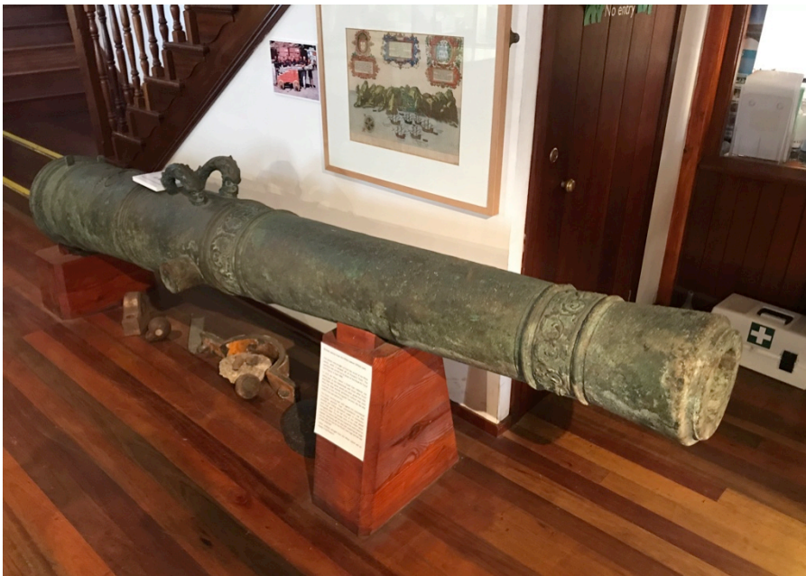
Figure 3 - Cannon from the Witte Leuw .

of wind systems which saw them pass to the west of St Helena on outward voyages but on the return from the Orient the trade winds, as Tavernier noted, brought the laden ships back close to the island. That St Helena was useful to such returning ships and, thus, was an active participant in global trade can be realised from the comment of a French navigator, Francoise Pyard who after a voyage in 1611 characterised the island as this “halfway house in the midst of the great ocean” (1890: 300). At the “halfway house” fresh water was available and, thanks to the aforementioned actions of the Portuguese in stocking the island with livestock – principally hogs – as well as planting fruit trees and herbs, some comestibles could be acquired. The Portuguese did not settle St Helena, but tried to keep its existence secret so that its potential for revictualing (resupplying) ships might be reserved for their own vessels. However, following Tavernier’s observation, it was inevitable that other trading nations would independently discover the island, leading to the contestation mentioned and the sinking of the Witte Leuw in 1613, a cannon from which is now a central exhibit in St Helena’s museum.