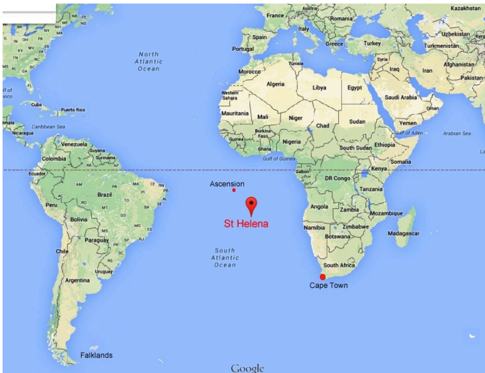
Figure 1 - The location of St Helena (Google Maps, 2018).

The same distinction between story and study might be made about the subject of history, which, in spite of the word’s second syllable, is more than just a compendium of individual narratives. Thus “island history,” as in the title of this article, cannot just deal with the story of islands. Take as a case the island of St Helena, situated in the South Atlantic between Angola and Brazil. The example of St Helena comes not from its time of renown when it was the place of incarceration of first Napoleon and then Boer prisoners from the South African War, but for an earlier period during its first couple of centuries of human habitation.