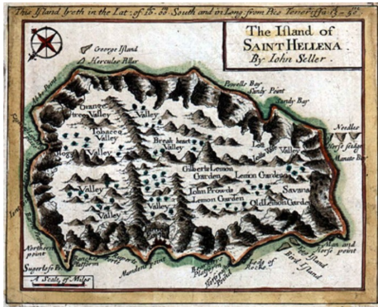
Figure 2 - A postcard of John Seller's 1675 map of St Helena