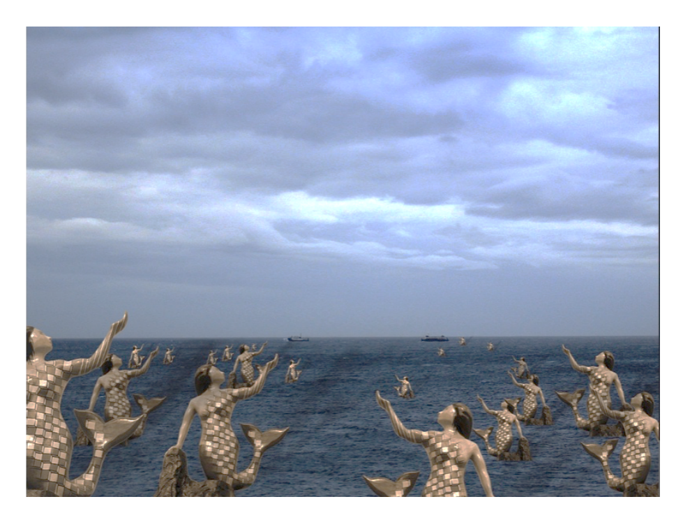
Figure 4 — 'Plucky Newfoundland ferry pilots on their evening run brave the mermaid infested waters between St. Phillip's and Bell Island' (Kent Barrett, 2006)

In subsequent years mermaid images have continued to appear in various contexts around St. John's, including in a panel in a large mural reflecting the city's maritime heritage commissioned by the city and painted by Kyle Boston in Scanlan's Lane in 2015.<sup>17 18</sup>