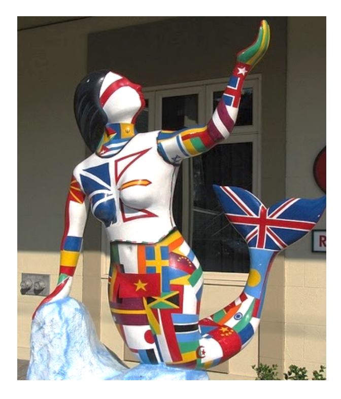
Figure 3 — Flag design mermaid, St. John's 2006.

The mermaid statues were rendered in various designs, including a flag motif mermaid (Figure 3 below — artist unknown). The statues were a popular attraction for tourists and locals alike<sup>16</sup> and also provided images that were subsequently re-used by other visual artists, such as Kent Barrett, who produced a series of works that photo-shopped the statue images and re-presented them in various locations around the easterly area of the island (such as his satirical rendition of "mermaid-infested waters" in the strait between Bell Island and St. Phillip's [approximately 15km east of St. John's] — Figure 4).