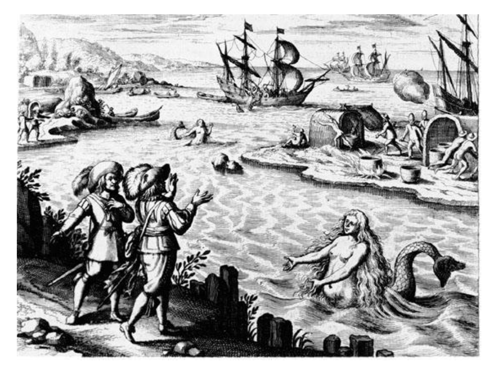
Figure 2 - Engraving by Theodore de Bry inspired by Richard Whitbourne's account of seeing a mermaid-like creature in St. John's Bay (1628).

other contexts.<sup>7</sup> Whitbourne's description was the basis of a visual image produced some eight years later by Dutch artist Theodore de Bry (Figure) 2 that represented two mermaids in a more conventional manner, with flowing tresses and scaled tails in a harbour identified as St. John's, serving to 'standardise' the creature described by Whitbourne with regard to dominant 17th Century artistic conventions of her form.