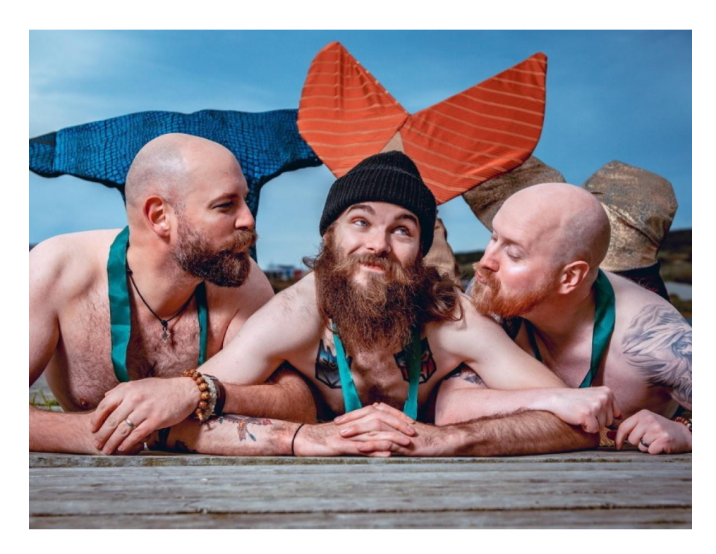
Figure 6 – Merb'y calendar promotional image (2017).

The repetition of the term "comfort zone" in the two quotations above illustrates how the act of donning a lower body costume more usually associated with mermaids that hobbles the movement of the wearer can be one that undermines stereotypical male body images and behavioural modes and thereby makes the wearer feel vulnerable. But, in this regard, Whelan's characterisation contrasts markedly with Hai's own comment on wearing a tail (Figure 7), namely that "it feels like I was meant to be in this" (Montgomery, 2017: online) and that: