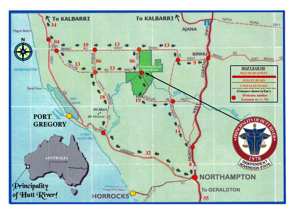
Figure 1 – Official Map of Hutt River Province showing its position in western Australia

The remainder of this article is structured as follows. The next section explains the concept of aislamiento and how it applies to the PHR, followed by a section that describes the events that motivated the establishment of the principality and its early years. The following three sections then discuss the international activities of the PHR as reported by the Australian Department of Foreign Affairs and Trade, tourism activity in the principality, and matters concerning the principality and taxes. A further section discusses the finals years of Casley's administration and is followed by a conclusion.