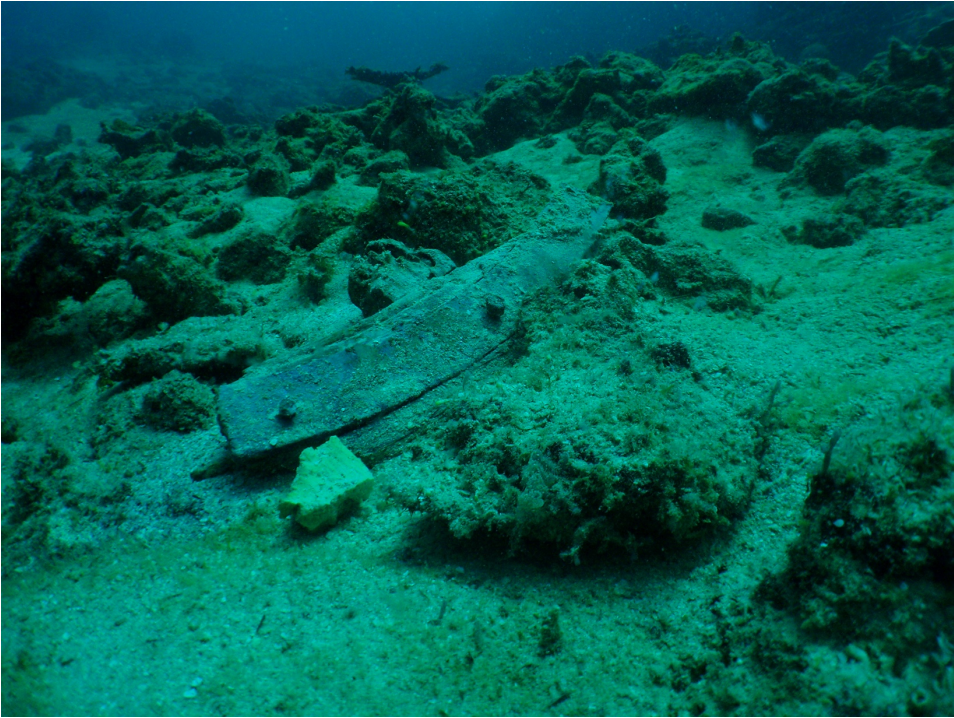
Figure 6 - Relic of an unidentified shipwreck (1876) on the sea floor, wood and copper - 23.5 x 14.7 x 4.6 cm.