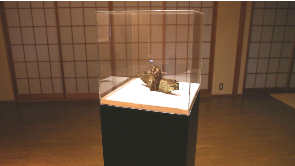
Figure 7 - Relic exhibited as part of James Jack's Sea Birth: part one (2017) Museum in the Sky installation view (relic courtesy of Okinawa Archaeological Culture Center).