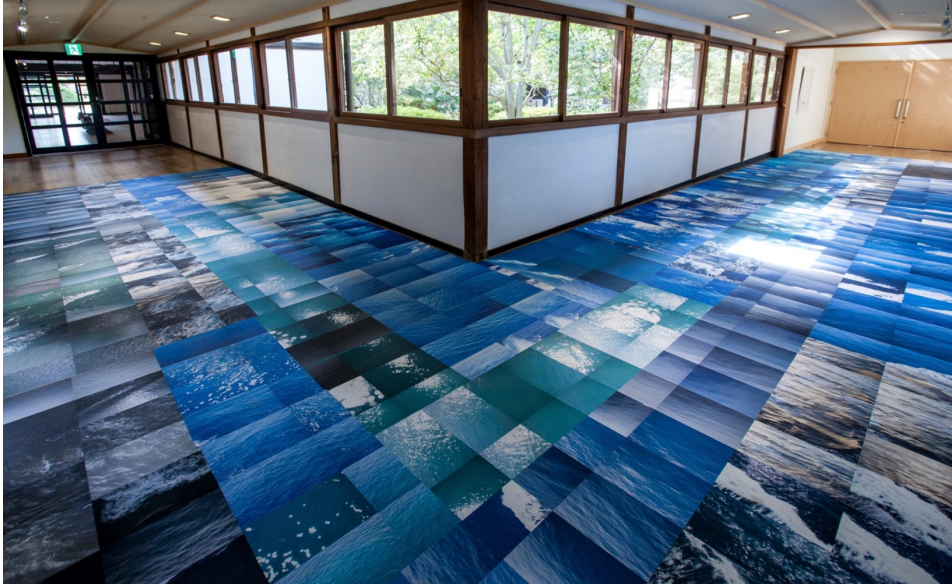
Figure 2 - James Jack Migration of a Cycad 2015 Handmade walnut ink on paper and digital inkjet prints mounted on floor at Shōkōshōreikan historic site, Ritsurin Garden, Takamatsu, Japan 76 x 56 cm & variable dimensions (installation view Complex Topographies: The Garden exhibit).

consisted of an installation of images of the sea taken aboard the ships affixed to the floor to be walked on. At the entrance was a drawing of the sotetsu tree carried three centuries ago and at the end was a drawing of the black pine sapling that I carried. During the production of this work, I spent more time on a ship than on land in Okinawa, so I was left with the memory of a sea of possibilities.